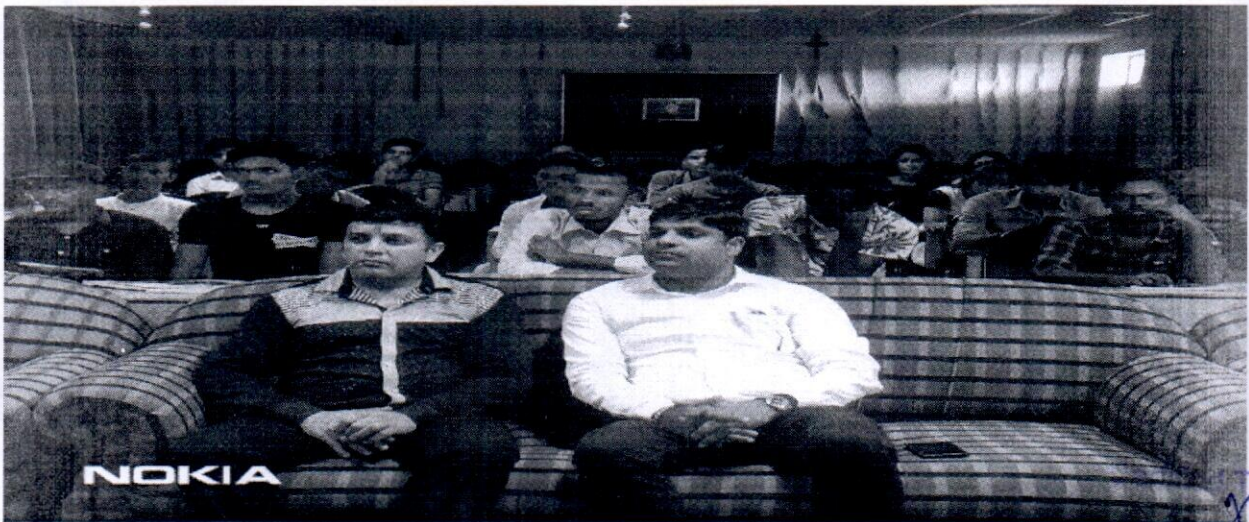
Participants attending the workshop (18.03.2019)

True Copy Registrar Jagan Nath University, Jaipur